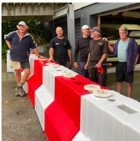
Flood defences at Aramoho Whanganui Rowing Club Incorporated

■ During the year, the Foundation adopted the on-line board management system BoardPro, negating the need for printing and delivery of board papers to trustees and management.